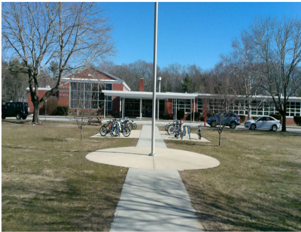
Hampden Meadows ES